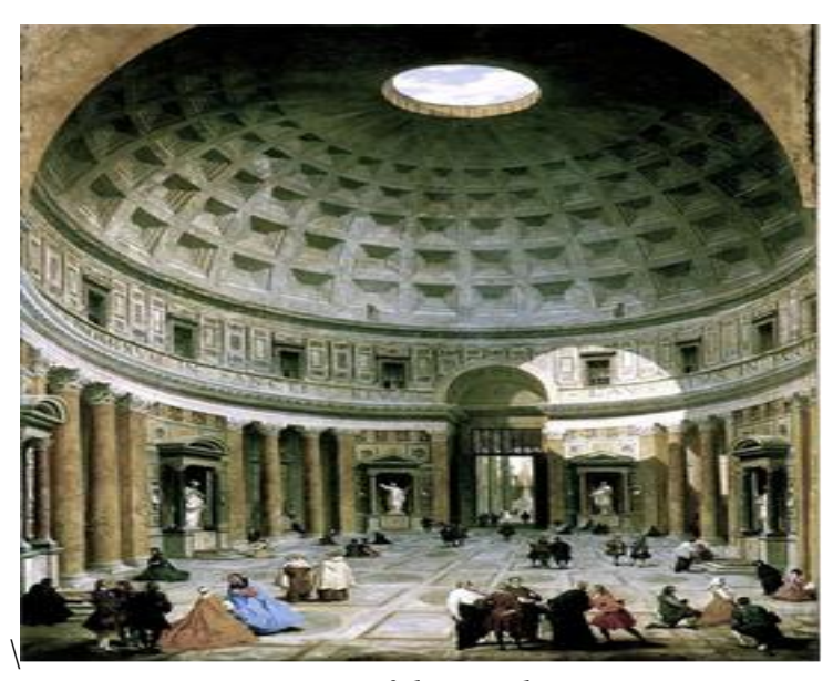
Interior of the Pantheon