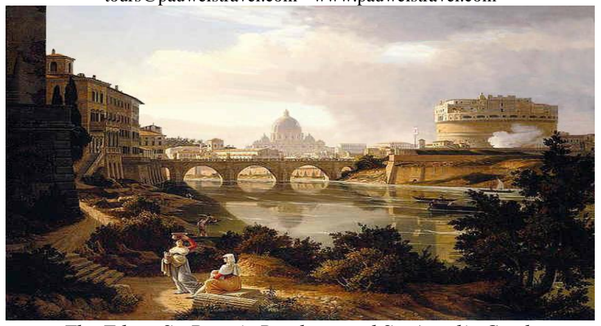
The Tiber, St. Peter's Basilica, and St. Angel's Castle on a painting of 1834 by Rudolf Wiegmann